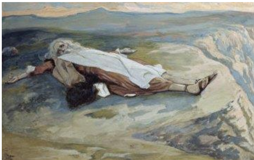
"The Death of Moses" – James Tissot